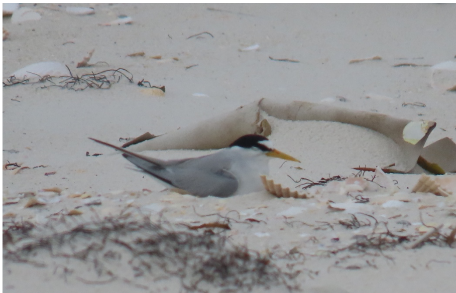
Least tern sitting on a nest on the west side of the island